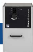
ceramill® airstream Suction