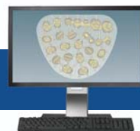
ceramill® match 2 Milling Software