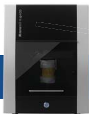
ceramill® map400 Scanner

Coolant supply tank connection large volume capacity ensures long operating cycles