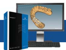
ceramill® mind Scanner Software