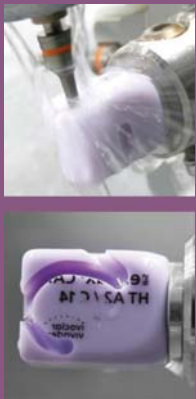
"Carving Mode" – excess material is being cut off as a whole