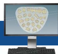
ceramill® match 2 Milling Software