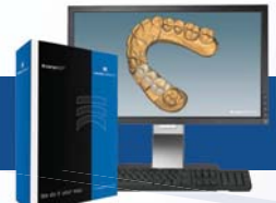
ceramill® mind Scanner Software