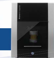
ceramill® map400 Scanner

Coolant supply tank connection large volume capacity ensures long operating cycles