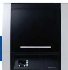
ceramill® therm 3 Sintering Furnace