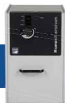
ceramill® airstream Suction