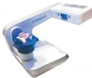
Black & White Texture